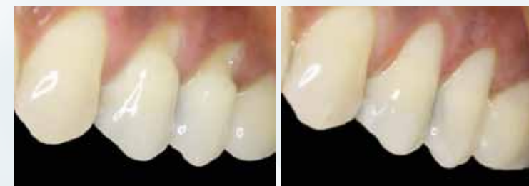
Before and after Class V restoration finished with BEAUTIFIL Flow Plus

The Standard kit (Part Number 2000S) contains two F00 and two F03 viscosities in shades A2 and A3, and the Pedo kit (Part Number 2000P) contains two F00 and two F03 in shades A1 and Bleach White. Both kits also contain samples of Shofu's other top selling products including: BeautiBond, One Gloss, Super Snap, and BEAUTIFIL II. Beautiful Flow Plus kits retail for only $99.95 a $160 value!